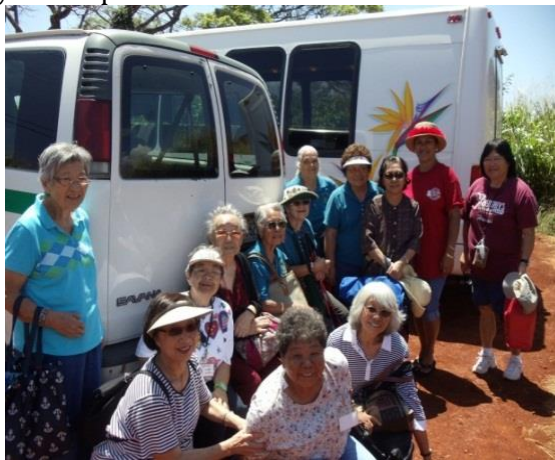
Mei 18 th Friday... 12 Whitmore Seniors ages 60-90 came to Kūkaniloko for their very first visit... eō

E pule kākou... Kupuna who hold the wisdom of the recent past and keiki‘oka‘āina who are the vessels of the future, you come to Kūkaniloko to connect to and center at the Piko of our Nation, ko Hawai‘i pae‘āina . We, of the Hawaiian Civic Club of Wahiawā, are here to embrace each and every one of you so that you know that we care deeply for your responsibilities... THERE IS NO FUTURE WITHOUT A PAST, AND BOTH ARE HERE IN THE NOW...amama