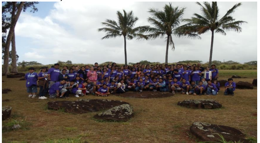
Mei 23 rd Wednesday... Mā‘ili Elementary School visited Kūkaniloko with 85 haumana and their chaperones, the future! a great day indeed!